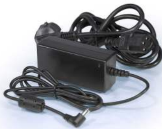
Power supply unit